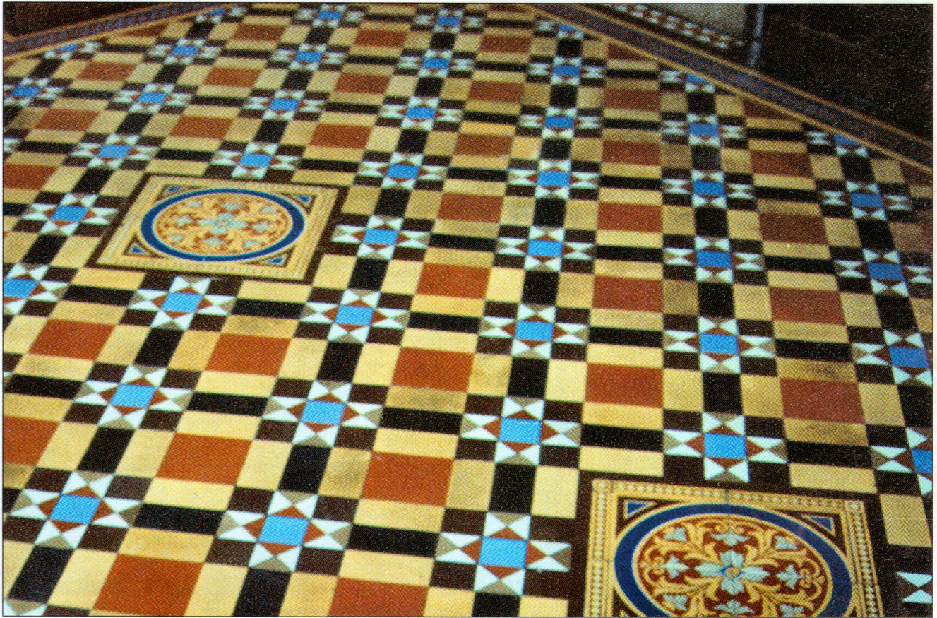
Cumberland House Victorian encaustic & geometric tiled floor restored.

All the new tiles used were bought from H&R Johnsons under the Minton Hollins range name the geometric tiles we cut to size from 6x6 inch tiles the encaustic used were the Telford Rope border tiles, they do show up against the original but look a damn sight better than grubby red tiles.